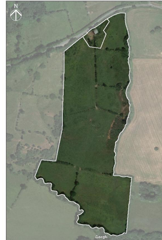
APPLICATION SITE Site edged white

THIS COPY HAD BEEN MADE BY OR WITH THE AUTHORITY OF RYEDALE DISTRICT COUNCIL PURSUANT TO SECTION 47 OF THE COPYRIGHT DESIGNS AND PATENTS ACT 1988. UNLESS THAT ACT PROVIDES A RELEVANT EXCEPTION TO COPYRIGHT, THE COPY MUST NOT BE COPIED WITHOUT THE PRIOR PERMISSION OF THE COPYRIGHT OWNER.