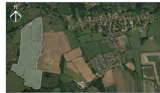
SITE LOCATION Relative to Ampleforth village Site highlighted and edged white